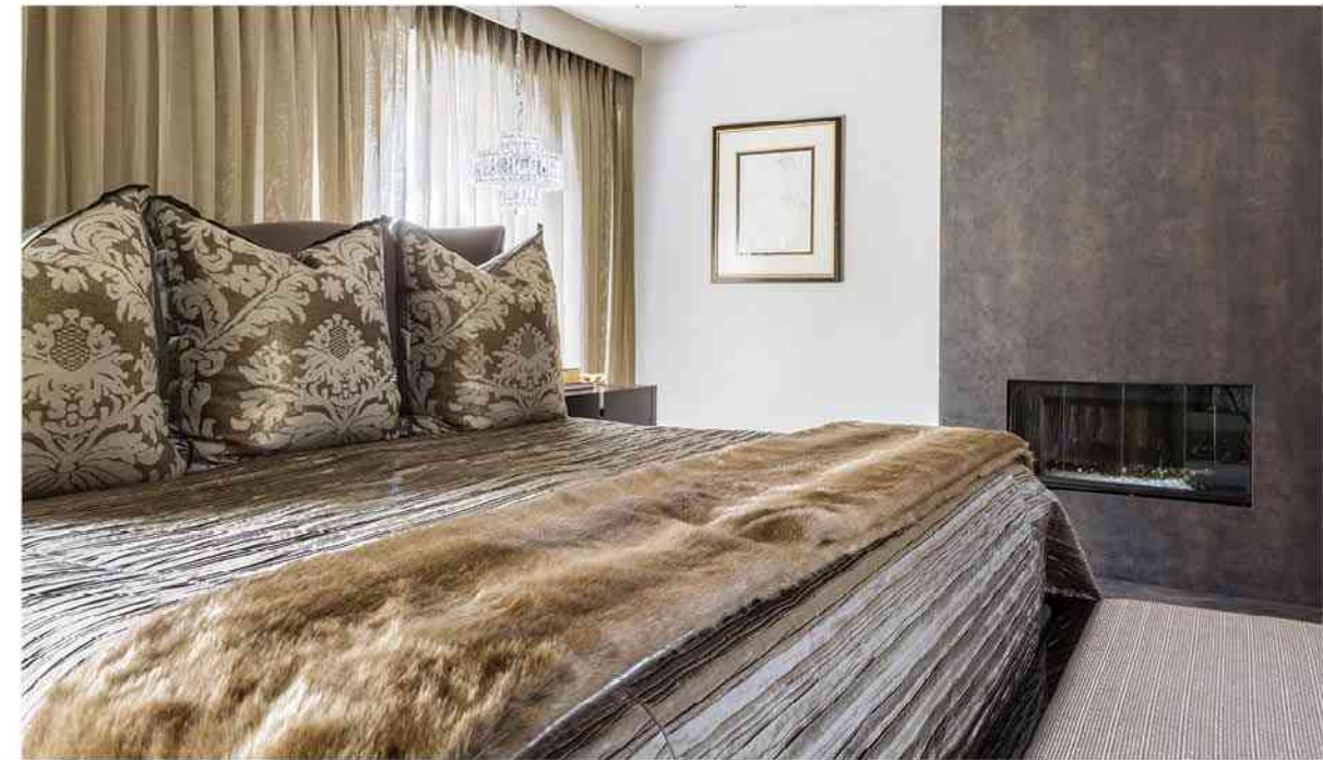
Eklektik Touches Clockwise from far left: A floating Murano glass wall divides the dining and living rooms; in the master bedroom, Anderson lined a full wall with luxurious fabric; the living room is divided in half by a two-sided fireplace.