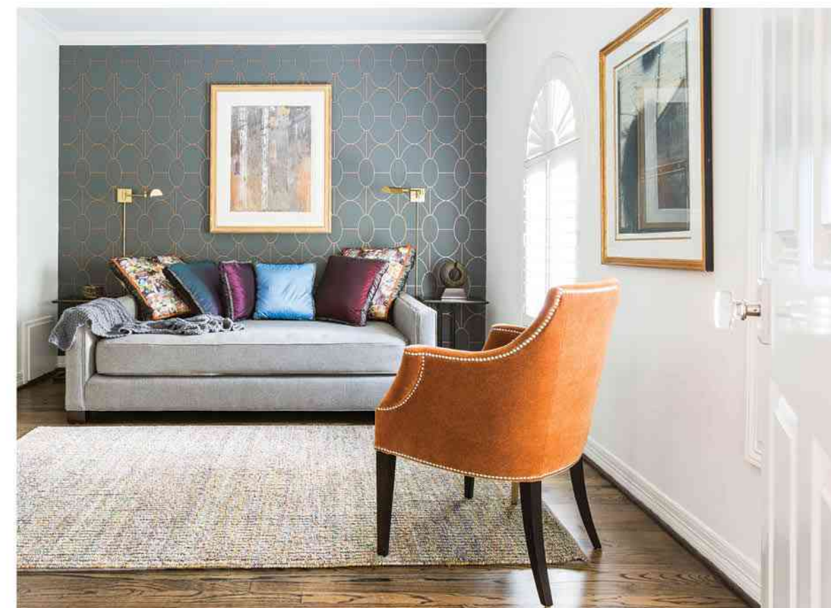
Stop and Stair Clockwise from opposite page: A gold and green lacquer Christopher Guy mirror hangs at the base of the winding stairway; chandeliers throughout the home, like this one in the dining room, are “jewelry for the ceiling,” says designer Anderson; a light-filled sitting area with pops of saturated color. Previous spread: The living room includes colorful touches like a multicolor chaise to accentuate the art.